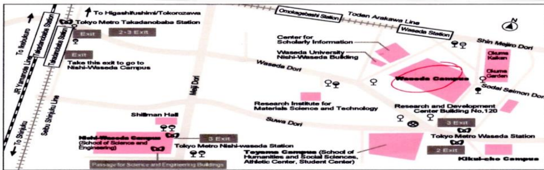
Waseda Campus Map

https://www.waseda.jp/top/en/access/waseda-campus http://www.waseda.jp/eng/common/images/campus/map_printable_waseda.pdf (International Conference Center=18th Building)