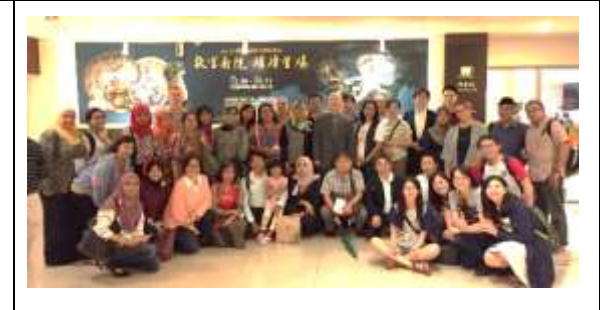
At National Palace Museum in Taipei on Nov. 7

At Gala Dinner, The Sherwood Taipei, on Nov. 5