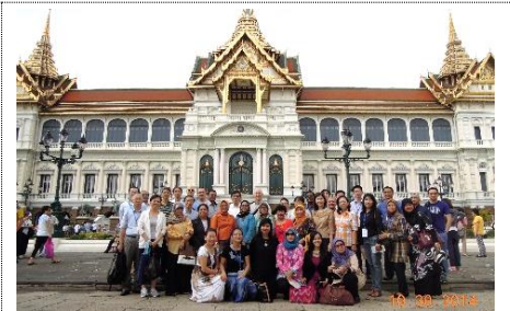
APMAA 2014 in Bangkok