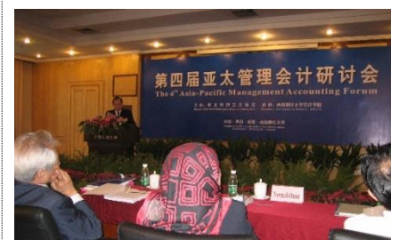
APMAA 2007 in Chengdu, China