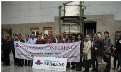
APMAA 2013 in Nagoya, Japan