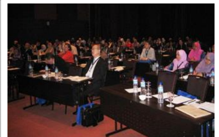
APMAA 2011 in Shah Alam, Malaysia