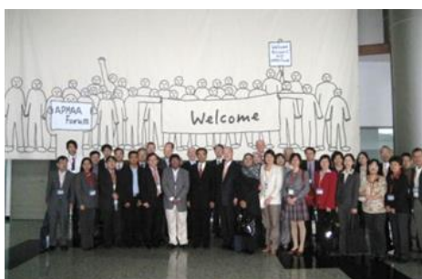
APMAA 2010 in Taipei, Taiwan