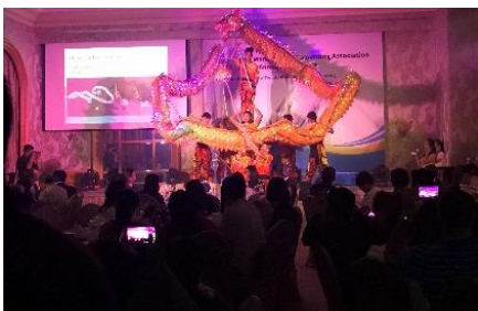
↑ APMAA 2016 in Taipei