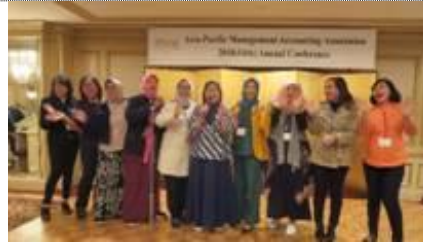
APMAA 2018 in Tokyo