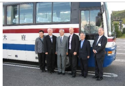
APMAA 2009 in Beppu, Japan