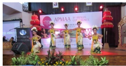
APMAA 2015 in Bali, in Indonesia