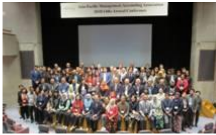
APMAA 2018 in Tokyo