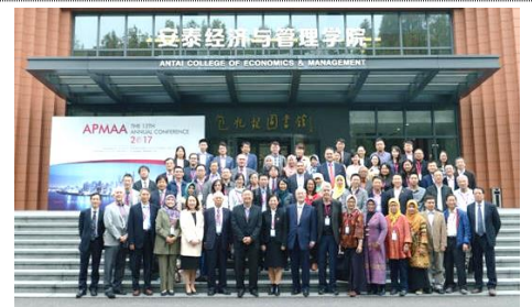
APMAA 2017 in Shanghai