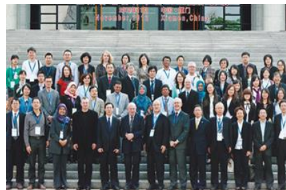
APMAA 2012 in Xiamen, China