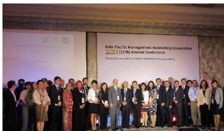
APMAA 2016 in Taipei, Taiwan