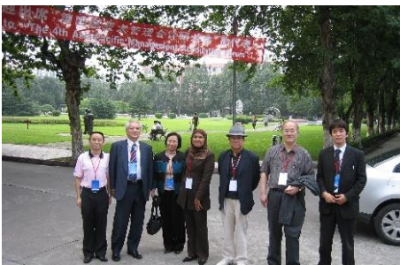
↑ APMAA 2007 in Chengdu, China