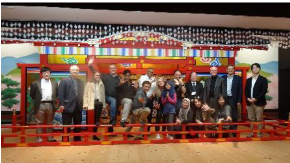
Asia-Pacific Management Accounting Association

The conference was hosted by APMAA Japan and Waseda University at the International Conference Center of Waseda University, Tokyo . There were over 130 research papers and 211 paid participants . International participants were 106 , from more than 20 countries, including the Asia-Pacific region, Oceania, the Middle-East, Europe and North America. During the conference, 107 research papers were presented and discussed: 91 papers in the parallel sessions, 12 papers in the doctoral colloquium.