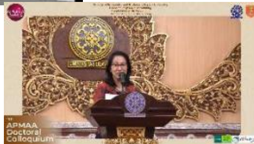
Asia-Pacific Management Accounting Association