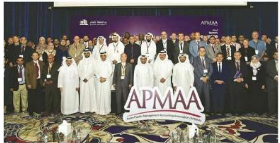
Asia-Pacific Man Association