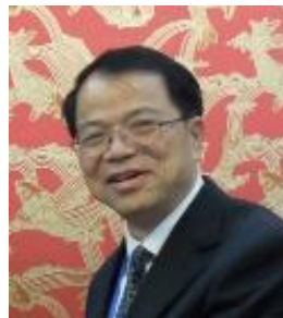
Asia-Pacific Management Associati