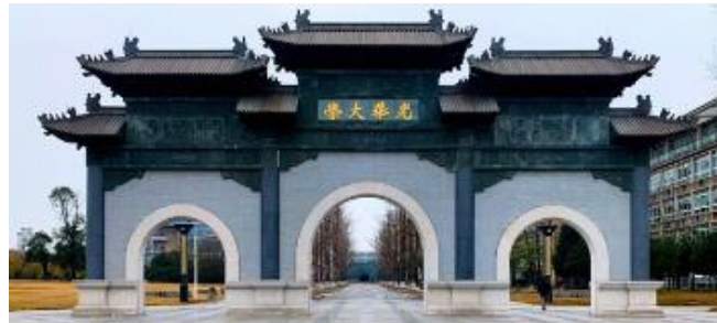
Asia-Pacific Management Accounting Association